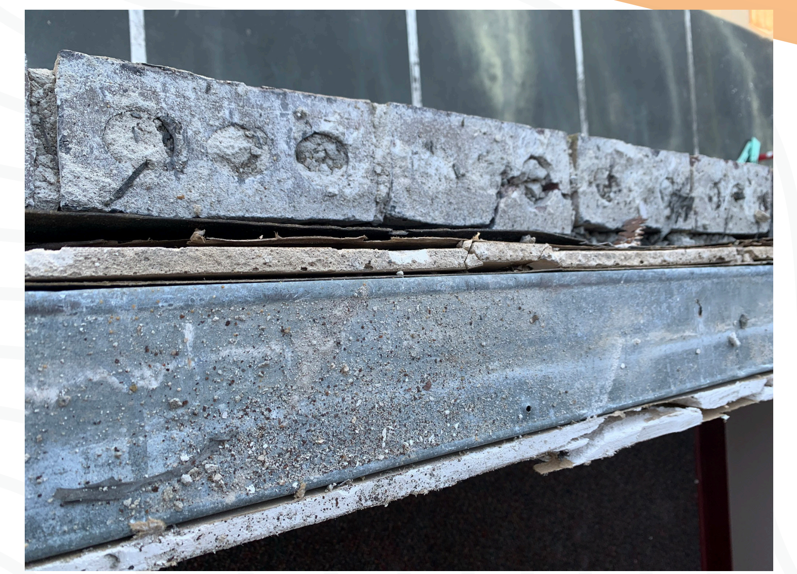
INTERIOR WINDOW REMOVED BEFORE REPAIR