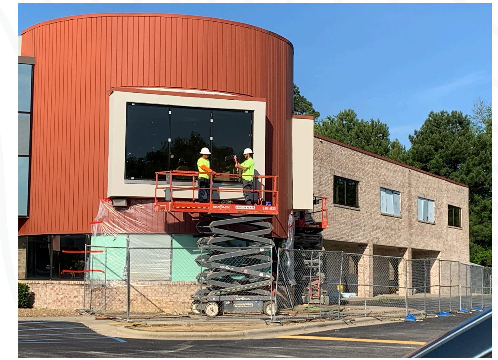
RIGHT ROUND WINDOW INSTALLED