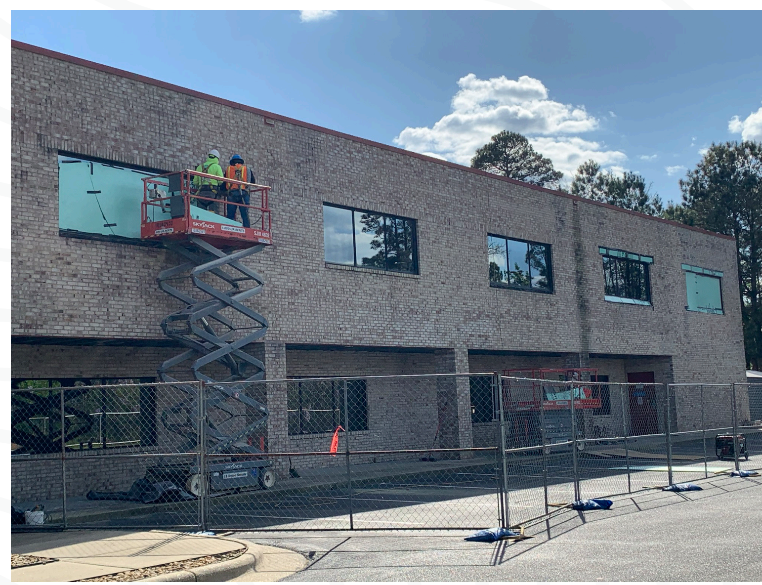
NORTH-SIDE WINDOW REMOVAL, SECOND FLOOR