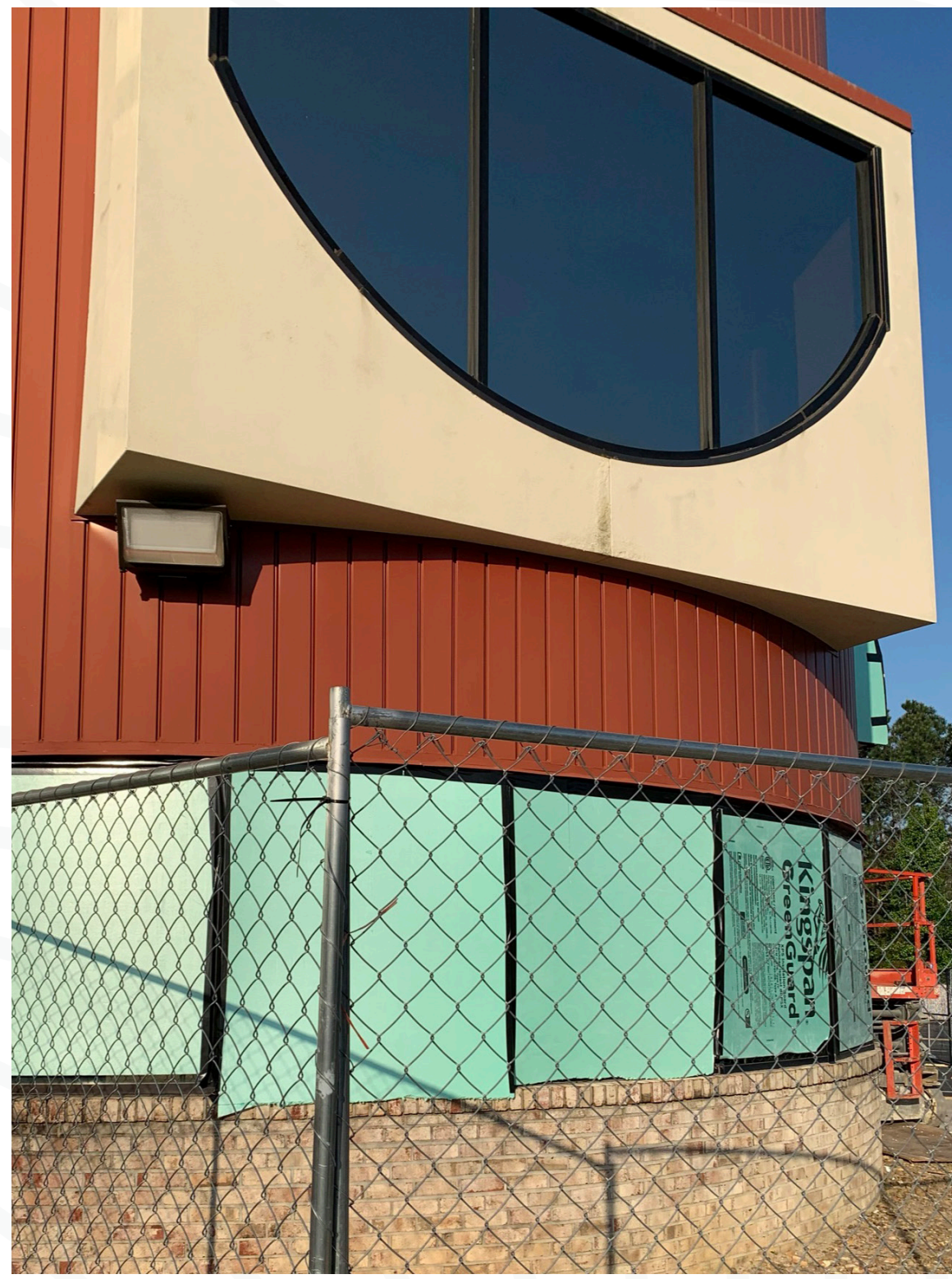
RIGHT ROUND WINDOW ABOVE LIBRARY