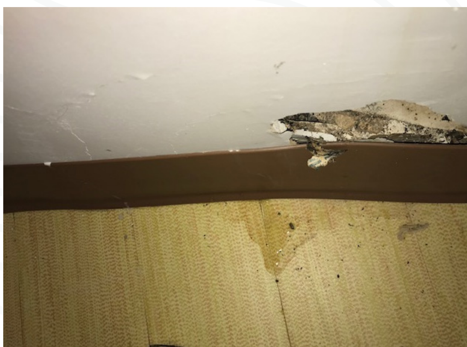
LIBRARY LEAK AND MOLD