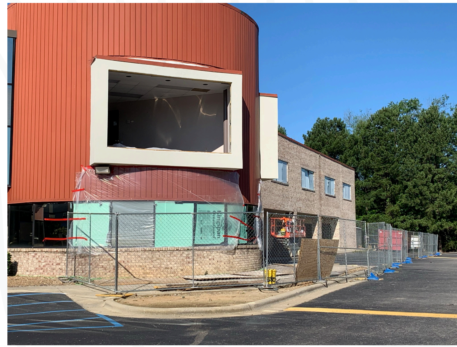
RIGHT ROUND WINDOW INITIAL SQUARING FOR REPAIRS