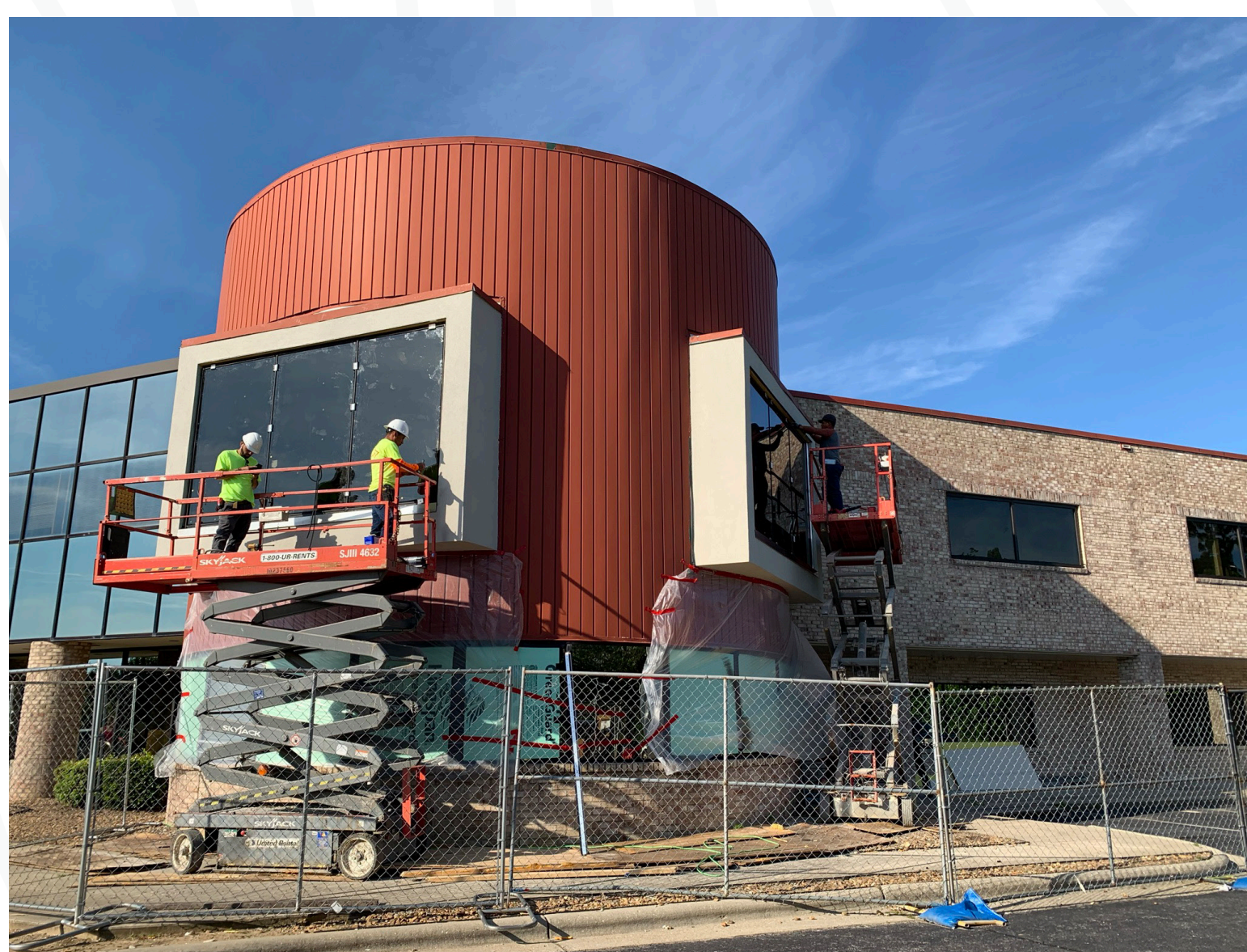
BOTH RIGHT ROUND WINDOWS INSTALLED