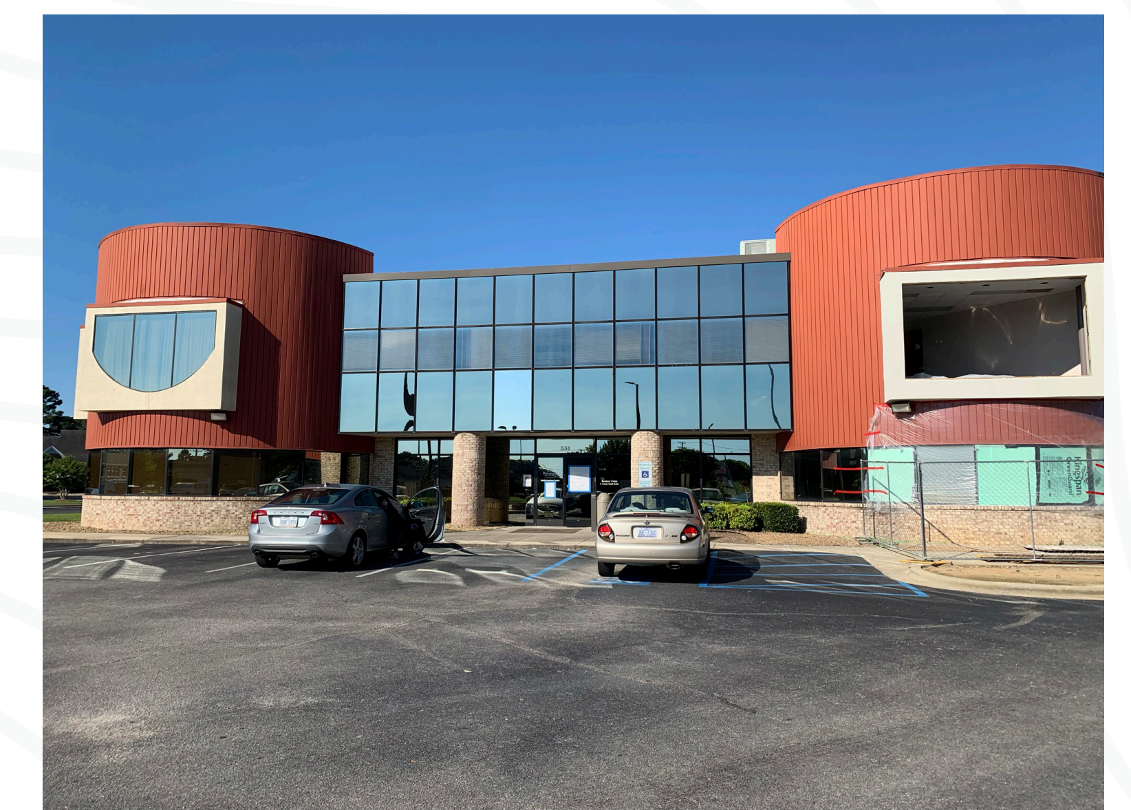
FRONT ENTRANCE COMPARISON SHOWS REPAIRED ROUND WINDOW AREA (R)