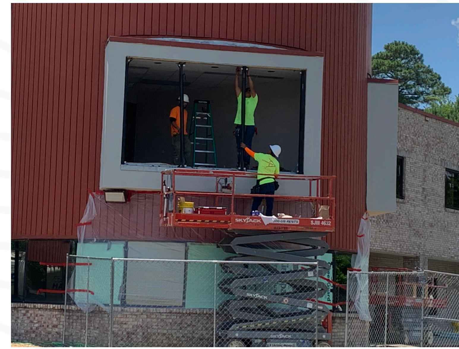
RIGHT ROUND WINDOW GOING IN