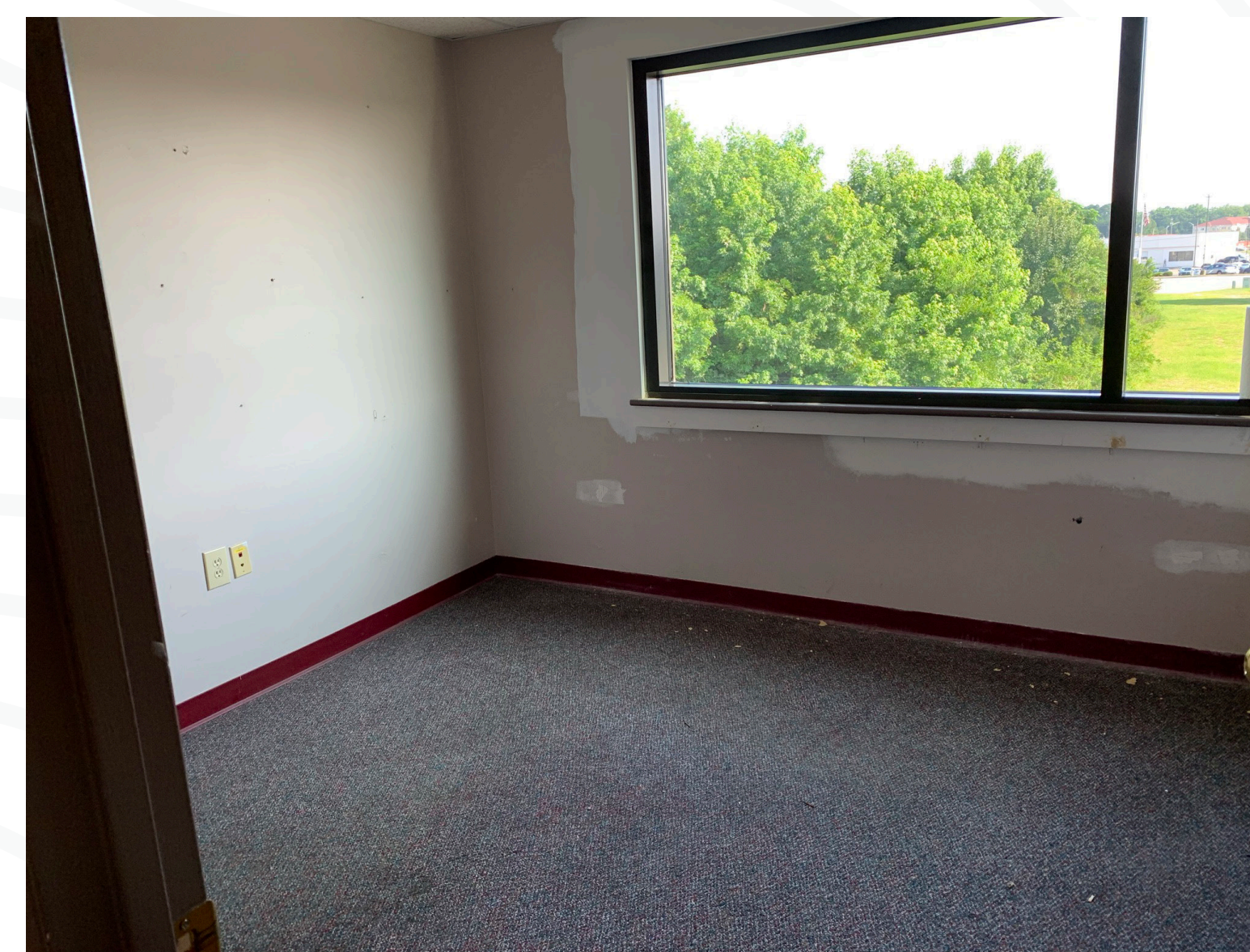
2ND FLOOR INTERIOR WINDOW REPLACEMENT COMPLETED