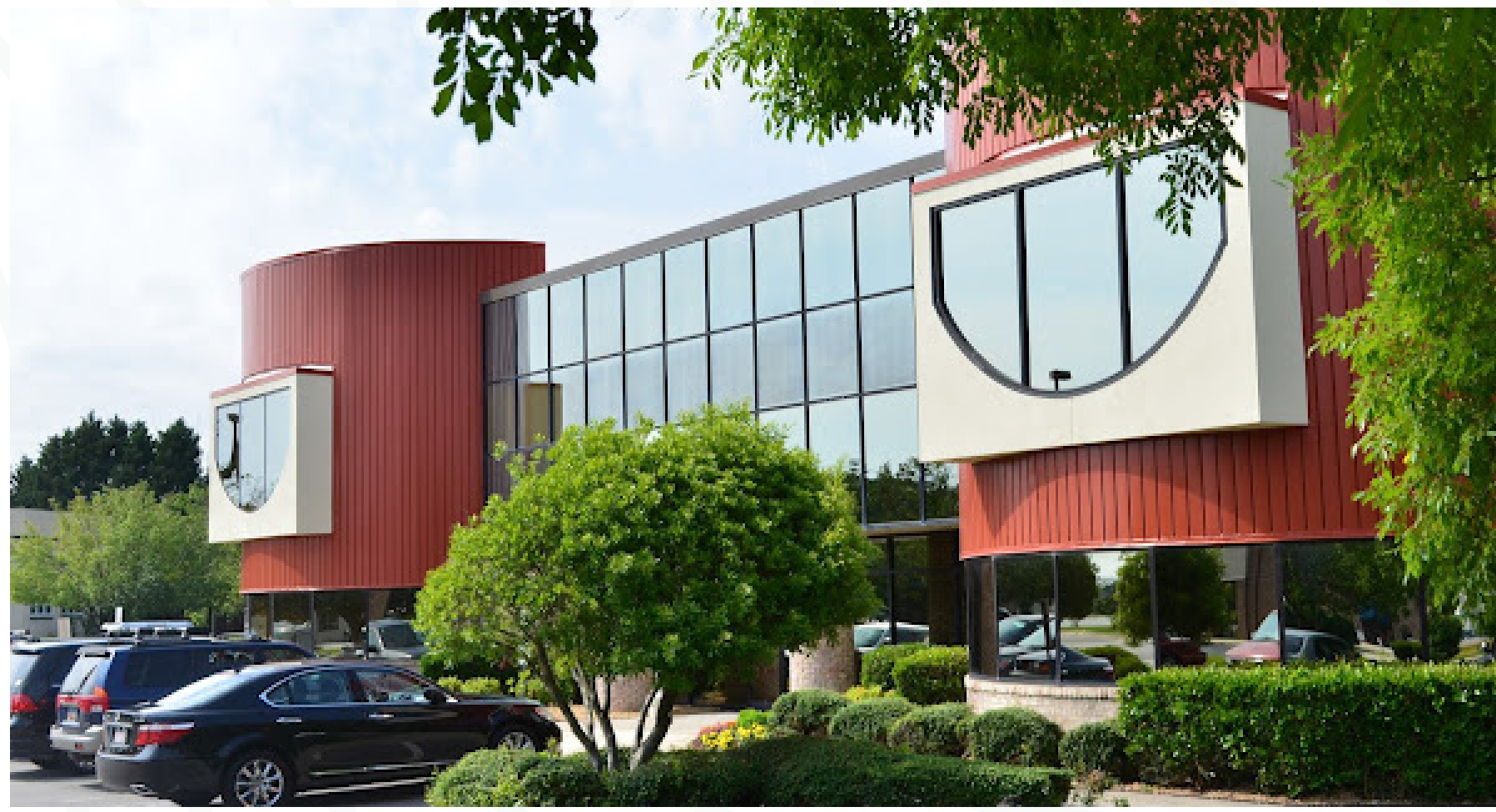
BUILDING SIDE VIEW BEFORE DAMAGE