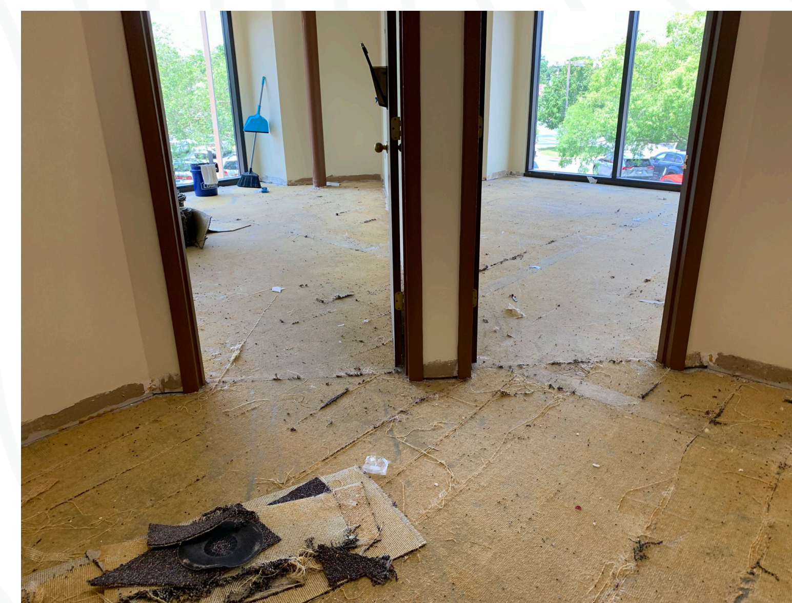
SAMPLE CARPET REMOVAL IN PRESIDENT'S SUITE