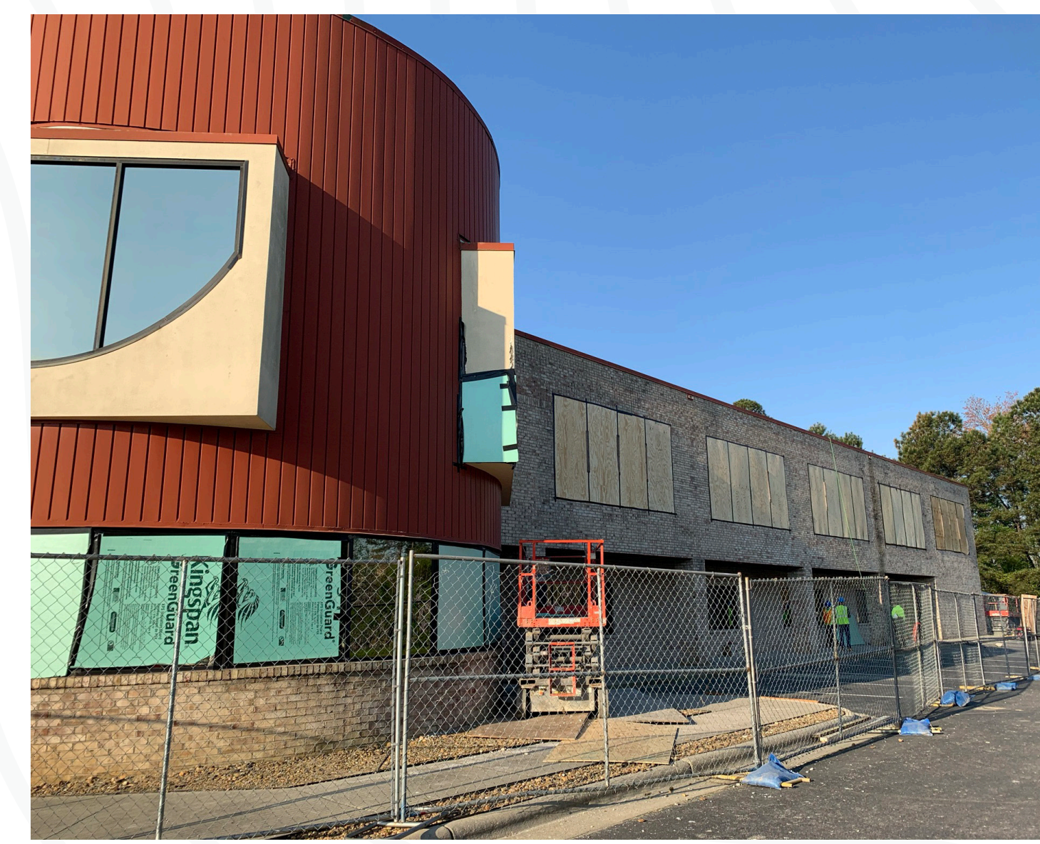
NORTH SIDE WINDOWS ENTIRELY REMOVED, SECOND FLOOR